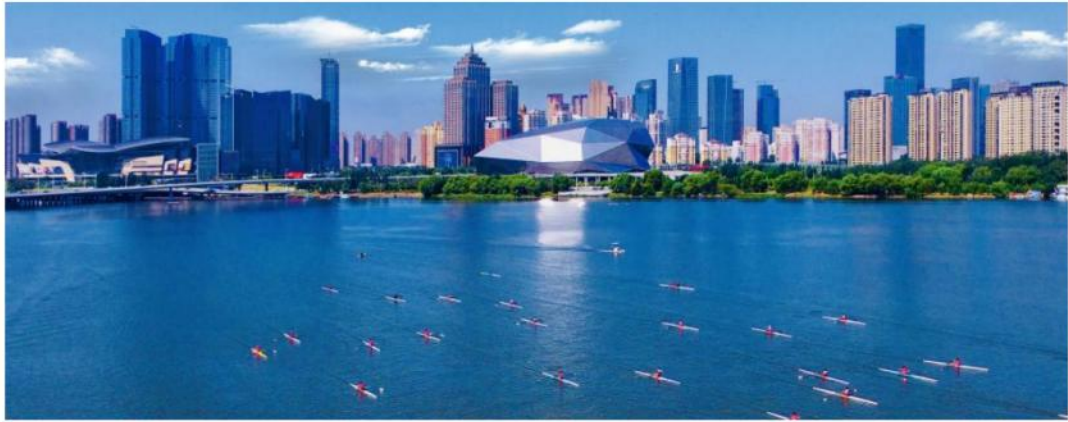
Photograph of the regatta area