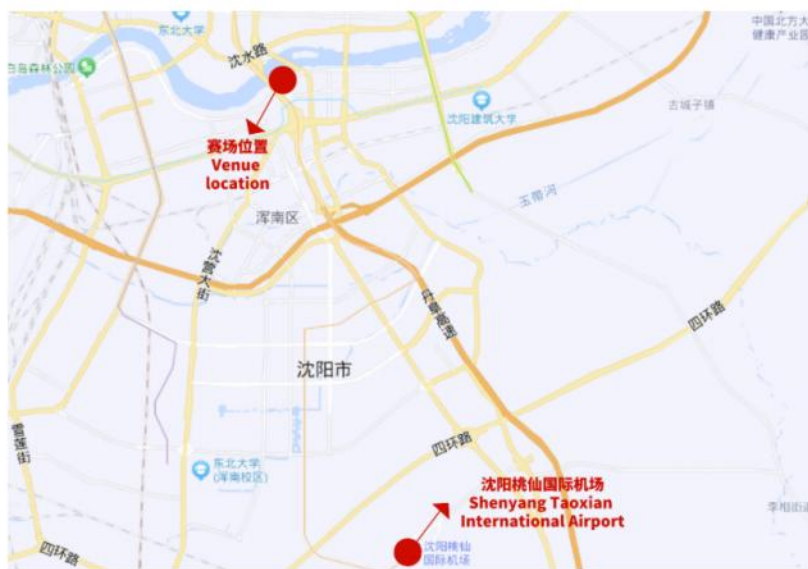
Regional map showing main roads and the nearest international airport location